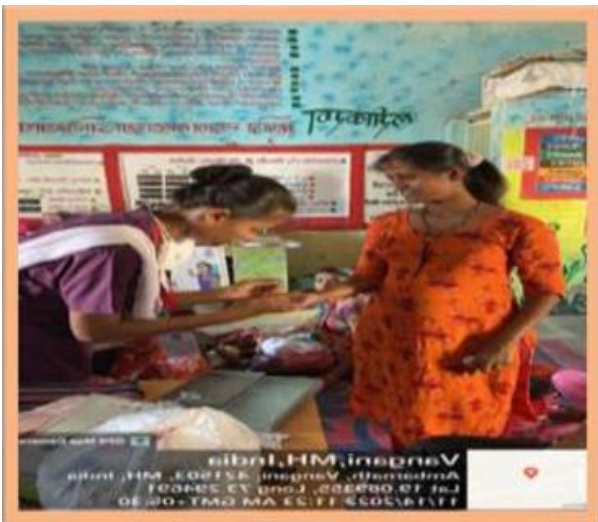
MATERNAL AND CHILD HEALTH SERVICES